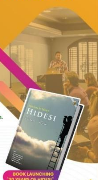
BOOK LAUNCHING "30 YEARS OF HIDESI"